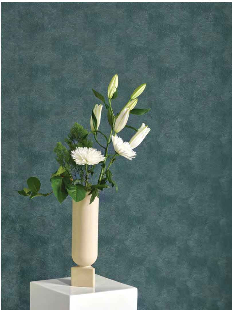
CONTOURED SUEDE | CTS-05 SEA MIST

Like the dots of Illusion and lines of Yakisugi, the use of individual elements to create larger forms connects all the patterns in the collection: